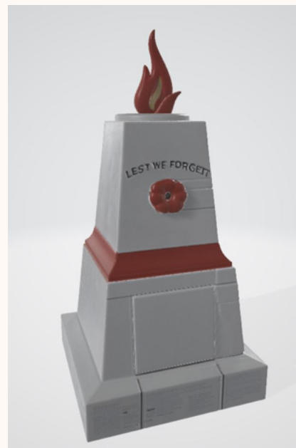
New Cenotaph Concept